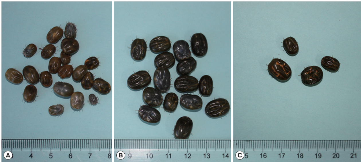
Fig. 1. Engorged females of Rhipicephalus (Boophilus) microplus on rabbits (A), cattle (B), and sheep (C).