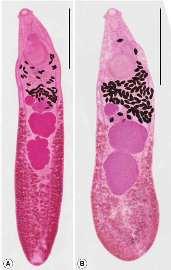
Fig. 2. Isthmiophora hortensis adults (Semichon's acetocarmine stained). (A) Normal slender. (B) Abnormal plump, recovered from a rat experimentally infected with metacercariae, which were collected from the Korean dark sleeper, Odontobutis platycephala , from Yugucheon (a branch of Geumgang) in Gongju-si, Chungcheongnam-do. Scale bar = 1,500 \mu m.

Among the worms recovered from an experimental rat at day